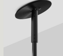
SLIM Ø14MM FIXED SWIVEL CANOPY CAN.SL.F14.SW.X-XXX