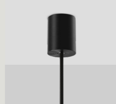
PUCK SINGLE PENDANT CANOPY CAN.PK.SPX-XXX