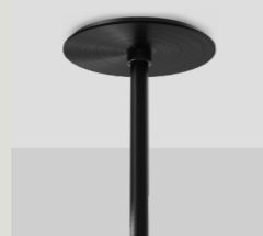
SLIM Ø14MM FIXED CANOPY CAN.SL.F14.X-XXX