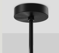
STANDARD Ø14MM FIXED CANOPY CAN.ST.120.F14.X-XXX