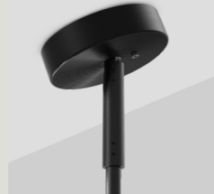
STANDARD Ø14MM FIXED SWIVEL CANOPY CAN.ST.120.F14.SW.X-XXX