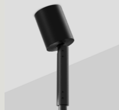
PUCK Ø14MM FIXED SWIVEL CANOPY CAN.PK.F14.SW.X-XXX