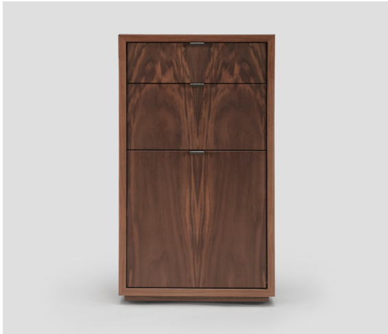
wishbone 3-drawer cabinet