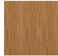
RWO-N: Rift White Oak, Natural