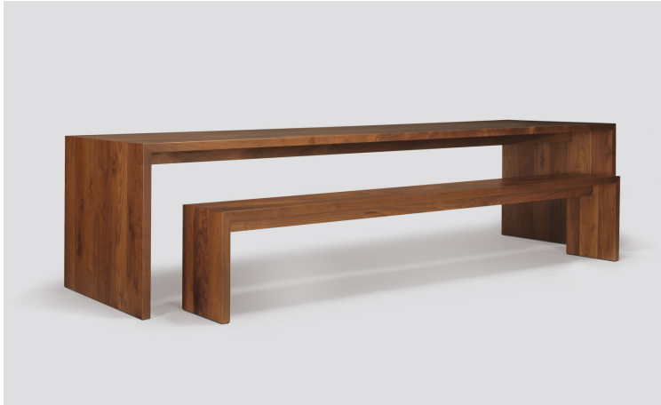
lineground community table