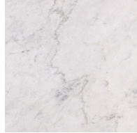
CRM: Carrara Marble