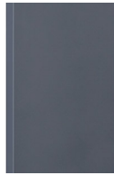
MOC: Matte Opaque Charcoal