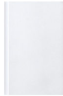
MOW: Matte Opaque White