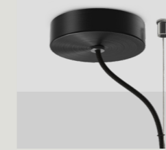
STANDARD - 120MM SINGLE PENDANT + EXTERNAL CEILING MOUNT CANOPY CAN.ST.120.SFCM.X-XXX Ø120 X 30MM / 4.7" X 1.2"