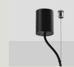
PUCK SINGLE PENDANT + EXTERNAL CEILING MOUNT CANOPY CAN.PK.SFCM.X-XXX Ø50 X 65MM / 2" X 2.6"