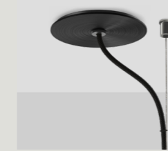
SLIM SINGLE PENDANT + EXTERNAL CEILING MOUNT CANOPY CAN.SL.SFCM.X-XXX Ø120 X 7MM / 4.7" X 0.3"