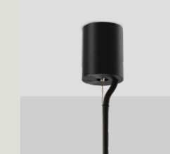
PUCK SUSPENSION + FLEX CANOPY CAN.PK.SF.X-XXX Ø50 X 65MM / 2" X 2.6"