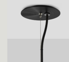
SLIM SUSPENSION + FLEX CANOPY CAN.SL.SF.X-XXX Ø120 X 7MM / 4.7" X 0.3"