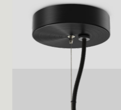
STANDARD - 120MM SUSPENSION + FLEX CANOPY CAN.ST.120.SF.X-XXX Ø120 X 30MM / 4.7" X 1.2"