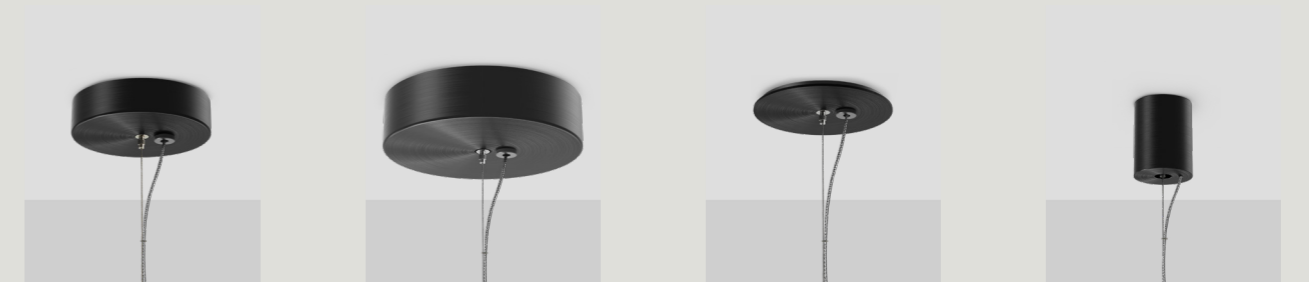
STANDARD SUSPENSION + COAXIAL CANOPY CAN.ST.120.CX.X-XXX Ø120 X 30MM / 4.7" X 1.2" DRIVER HOUSED IN CEILING

ALL ROSS GARDAM CEILING MOUNTED FIXTURES COME SUPPLIED WITH A CEILING CANOPY UNLESS OTHERWISE SPECIFIED. EACH CANOPY INCLUDES ELECTRICAL CONNECTORS, EARTH WIRE AND CABLE RETENTION TO CONNECT TO MAINS POWER. THE BELOW IMAGES DEPICT THE CEILING CANOPIES AVAILABLE WITH EACH FIXTURE TYPE. IF NO CANOPY IS SELECTED, THE STANDARD CANOPY (NON US/CAN REGION) OR LARGE CANOPY (US/CAN) WILL BE SUPPLIED.