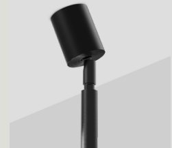
PUCK Ø20MM FIXED SWIVEL CANOPY CAN.PK.F14.F20.X-XXX