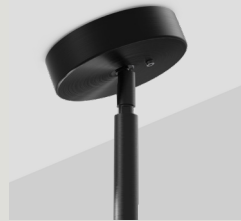
STANDARD Ø20MM FIXED SWIVEL CANOPY CAN.ST.120.F20.SW.X-XXX