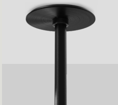
SLIM Ø20MM FIXED CANOPY CAN.SL.F20.X-XXX