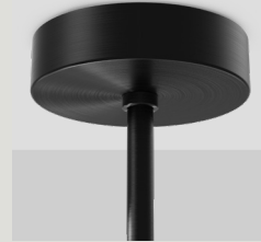
LARGE Ø20MM FIXED CANOPY CAN.ST.170.F20.X-XXX