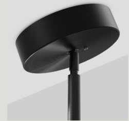
LARGE Ø20MM FIXED SWIVEL CANOPY CAN.ST.170.F20.SW.X-XXX