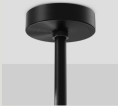
STANDARD Ø20MM FIXED CANOPY CAN.ST.F20.F14.X-XXX

ALL ROSS GARDAM CEILING MOUNTED FIXTURES COME SUPPLIED WITH A CEILING CANOPY UNLESS OTHERWISE SPECIFIED. EACH CANOPY INCLUDES ELECTRICAL CONNECTORS, EARTH WIRE AND CABLE RETENTION TO CONNECT TO MAINS POWER. THE BELOW IMAGES DEPICT THE CEILING CANOPIES AVAILABLE WITH EACH FIXTURE TYPE. IF NO CANOPY IS SELECTED, THE STANDARD CANOPY (NON US/CAN REGION) OR LARGE CANOPY (US/CAN) WILL BE SUPPLIED.