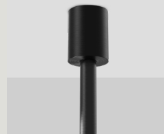
PUCK Ø20MM FIXED CANOPY CAN.PK.F20.X-XXX