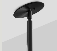
SLIM Ø20MM FIXED SWIVEL CANOPY CAN.SL.F14.F20.X-XXX