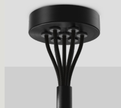
STANDARD CLUSTER PENDANT - 7 CAN.ST.120.SP.X-XXX