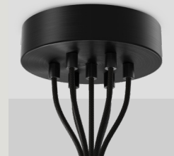
LARGE CLUSTER PENDANT - 7 CAN.ST.170.SP.X-XXX