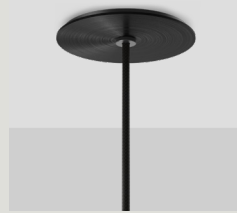
SLIM SINGLE PENDANT CANOPY CAN.SL.SP.X-XXX