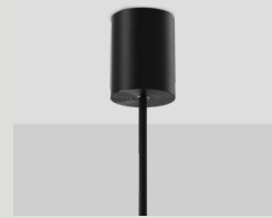
PUCK SINGLE PENDANT CANOPY CAN.PK.SP.X-XXX