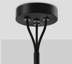
STANDARD CLUSTER PENDANT - 3 CAN.ST.120.SP.X-XXX