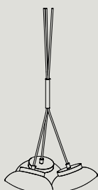
CP3 Ø 410 H 120 Ø 16.1" H 4.7"