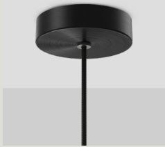
STANDARD SINGLE PENDANT CANOPY CAN.ST.120.SP.X-XXX