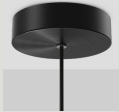
LARGE SINGLE PENDANT CANOPY CAN.ST.170.SP.X-XXX