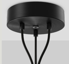
LARGE CLUSTER PENDANT - 3 CAN.ST.170.SP.X-XXX