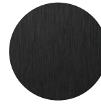
Satin Black Noir Satiné