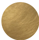
Aged Brass Laiton Antique