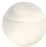
Alabaster White glass Verre Blanc Albâtre