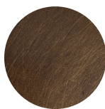
Aged Bronze Bronze Antique