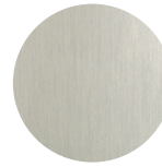
Satin Nickel Nickel Satiné