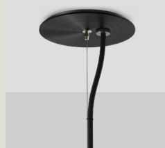
SLIM SUSPENSION + FLEX CANOPY CAN.SL.SF.X-XXX