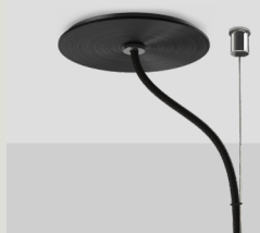
SLIM SINGLE PENDANT + EXTERNAL CEILING MOUNT CANOPY CAN.SL.SFCM.X-XXX