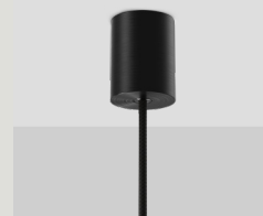
PUCK SINGLE PENDANT CANOPY CAN.PK.SP.X-XXX