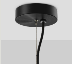
STANDARD SUSPENSION + FLEX CANOPY CAN.ST.120.SF.X-XXX