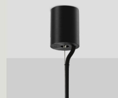
PUCK SUSPENSION + FLEX CANOPY CAN.PK.SF.X-XXX