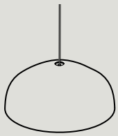
AP.S Ø450 H203 Ø17.7" H8"