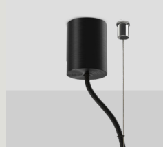
PUCK SINGLE PENDANT + EXTERNAL CEILING MOUNT CANOPY CAN.PK.SFCM.X-XXX