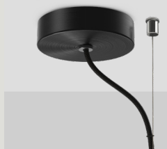
STANDARD - 120MM SINGLE PENDANT + EXTERNAL CEILING MOUNT CANOPY CAN.ST.120.SFCM.X-XXX